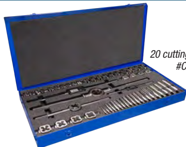
20 cutting sizes #C00608

All use Cap Style #1383 and Guide style #1384, unless noted with an asterisks.